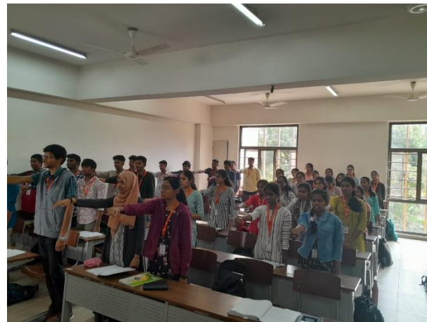
Sample pictures of students taking pledge on Swachh Bharat Abhiyaan Under EBSB from various departments